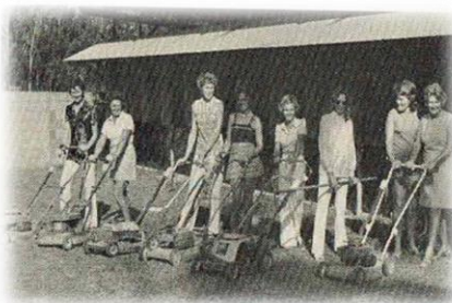
Above: Ladies with their mowers about to hit the 50m range at Gold Coast

The Queen's Birthday weekend is always a big weekend for the Gold Coast Pistol Club, this year was the biggest yet. 71 shooters from fourteen clubs competed.